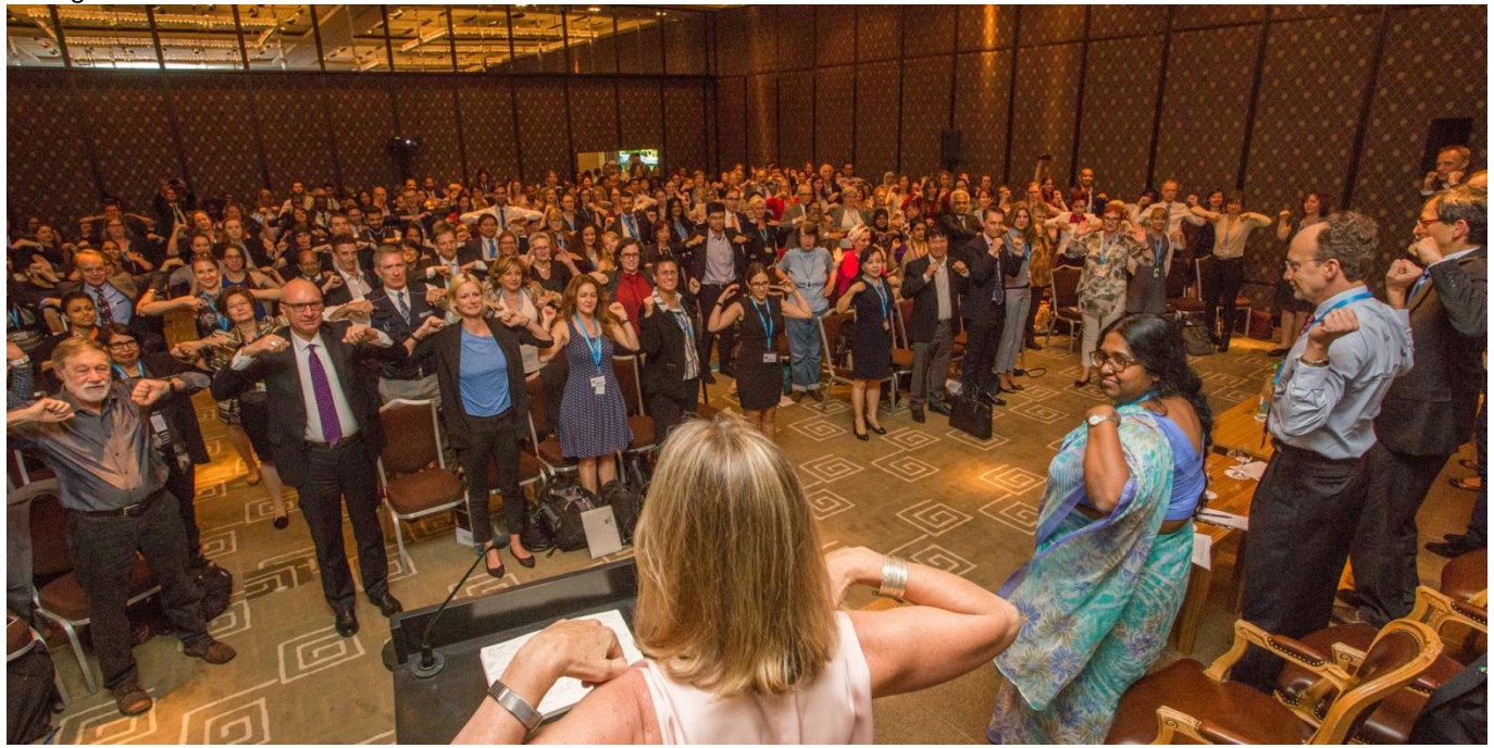
On Monday 22 May, the NCD Alliance hosted an event in the margins of the 70th World Health Assembly focused on Success Factors for NCDs: Pathways to Accelerate Progress.

Moderated by Richard Horton, Editor-in-chief of The Lancet, the panel explored good practice and effective solutions to stimulate progress on NCDs at national and regional level; catalytic strategies in NCD prevention policies and sustainable health systems for NCDs; and highlighted the upcoming 2018 UN High-level Meeting on NCDs as the next global milestone and opportunity to review and accelerate progress.